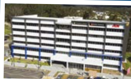
Now in the Mariners Centre of Excellence, Tuggerah (opposite Bunnings).