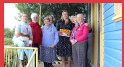
July 8, Ourimbah Hospital Auxiliary's 73rd annual general meeting