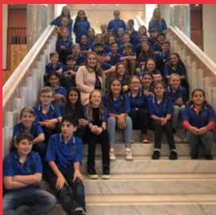
July 5, catching up with Wyoming Public School at Parliament House, Canberra

It has been a busy few months in Dobell. Here are a few highlights: