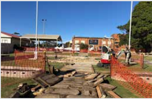
Toukley Cenotaph upgrade expected to be completed for Remembrance Day