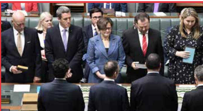
July 1, Official swearing in as a member of the 46th Commonwealth Parliament, Canberra